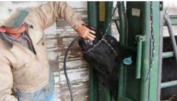
A veterinarian treating bloat by drenching with a tube

What I want to focus on are risk factors that increase incidence of bloat, and management practices that you can implement to reduce that risk. To further break this down, we will look at a pasture scenario, and a scenario of cattle consuming concentrates. In a pasture setting, the type of forage that represents the greatest risk of bloat are young succulent legumes like alfalfa, and clover. Grasses are less likely to be a problem unless they are young and vegetative like wheat pasture in the early stages. Dew, frost, or a recent rain has the tendency to increase the potential for a problem. Turning hungry cattle to a new pasture of young succulent legumes in the early morning would be when some producers could experience a problem. If you have pastures that could pose a risk you can: