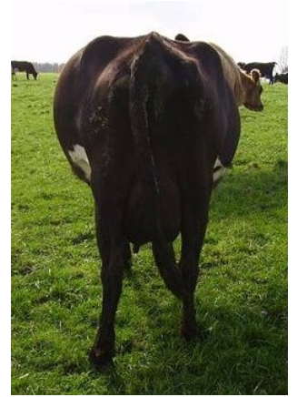
A cow suffering from Bloat

The most common cause of bloat is an excessive buildup of gas in the rumen in conjunction with the presence of foam or froth which impedes the animal's ability to belch off the gas. This "frothy bloat" is usually associated with overconsumption of lush, growing legumes but can occur with rumen acidosis or overconsumption of a high starch diet. Another possible cause could be from the way the animal is positioned when it is laying down. If the feet and legs are uphill from the rest of the body, it would be in somewhat of an unnatural position that could cause even normal rumen contents to block the opening to the esophagus and the ability to belch off gas build-up. Prolonged laying in such a position would increase the risk of bloat. Yet another potential cause of bloat occurs if the animal would happen to have some sort of obstruction in the throat, like a hedge ball. Blockage of the esophagus could block the exit of the gas accumulating in the rumen. The two latter scenarios account for a small percentage of bloat cases.